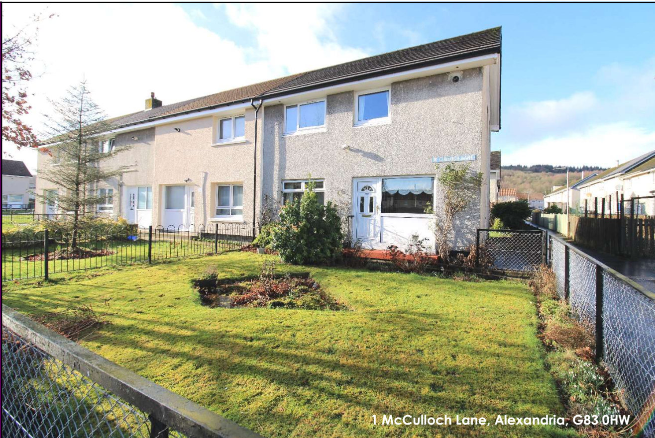
1 McCulloch Lane, Alexandria, G83 0HW

This spacious three bedroom end terrace villa sits in a quiet plot in the popular Tullichewan Estate and is a perfect family home due to its peaceful setting and close proximity to local schooling, amenities and public transport links.